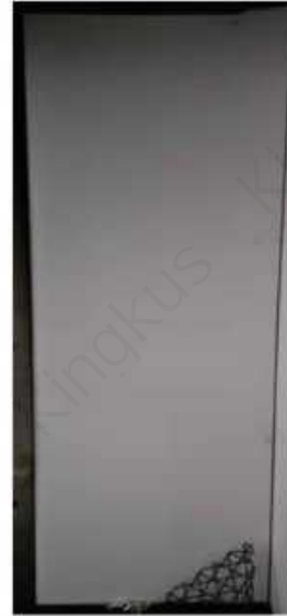
Before test (Short wing)