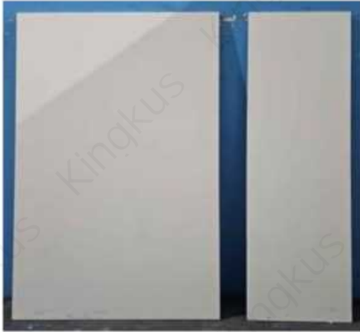
Front view (test side)