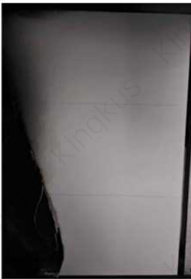
After test (Long wing)