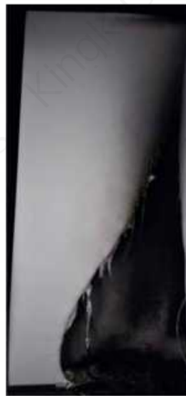
After test (Short wing)