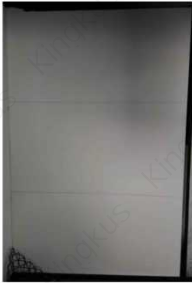
Before test (Long wing)